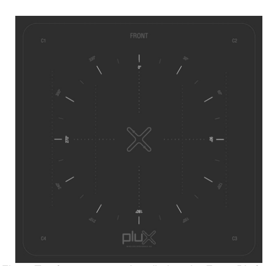
Fig. 3. Top face protractor installed on the Force Platform.