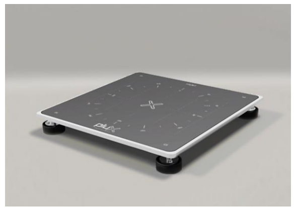
Fig. 1. biosignalsplux Force Platform.

Center of gravity distribution, jump analysis, weight assessment and force production capacity, are just some of the applications where force assessment is important. Our robust yet lightweight 1D force platform enables uncompromised data acquisition both in lab and field measurements.