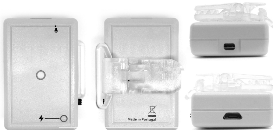
Fig 3: OpenBAN views.