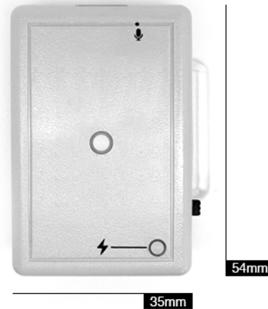
Fig 1: OpenBAN

Use only ACCESSORIES APPROVED AND VALIDATED for biosignalsplux.