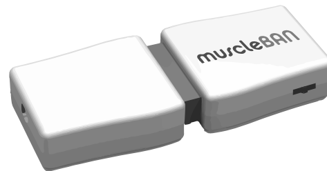
Fig. 1. MuscleBAN BE form factor.